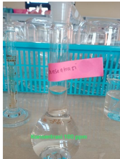
Asam askorbat konsentrasi 100ppm