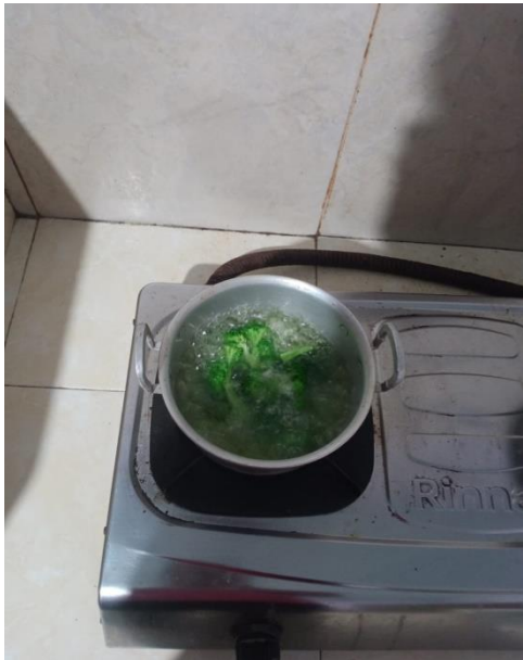
Proses perebusan brokoli