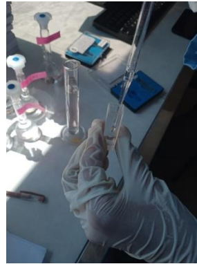
Sampel diletakkan pada kuvet