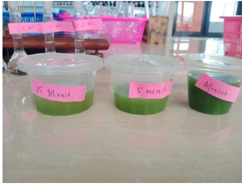
Filtrat yang didapat