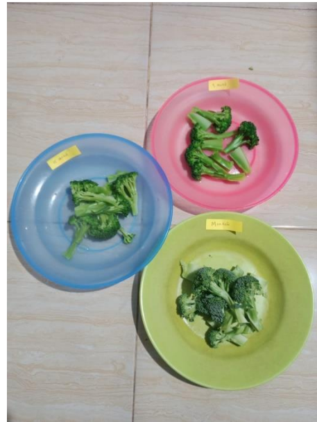
Brokoli mentah, direbus 5 menit, dan direbus 15 menit