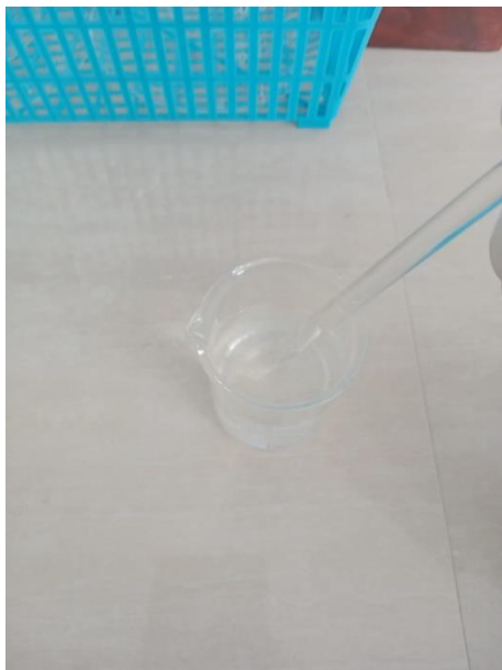
Asam askorbat konsentrasi 1000ppm