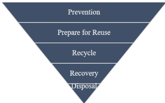
Figure 1. Waste hierarchy

This pyramid delineates the optimal approach, commencing with preventive measures and progressing to the reuse of excess food suitable for human consumption, followed by the recovery of food no longer intended for human consumption as animal feed, the recycling or recovery of high-value food molecules (like natural dyes), the recovery of nutrients and energy, and ultimately, the removal of food waste [21]. In that hierarchy, the recovery option is probably the most important before food scraps are thrown away.